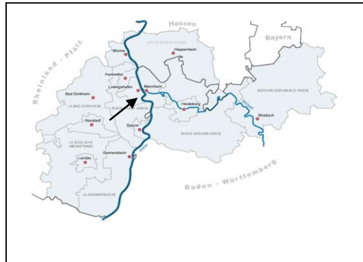
Illustration: City of Mannheim The European Rhine-Neckar Metropolitan Area