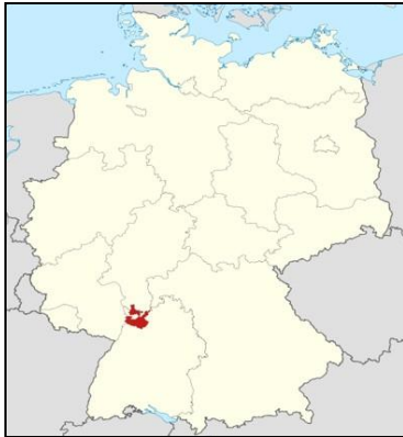
Germany and the Rhine-Neckar Metropolitan Area in the southwest